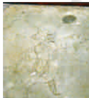
A graffito of a gladiator (probably a murmillo), stepping to the right and raising a large, rectangular shield—now on display in the Museo Archeological Nazionale di Napoli

I departed from Herculaneum on the same afternoon that the superintendent of Pompeii was announcing the recent discovery of the longest funerary inscription yet found there, which recorded the enormous sums spent by a local benefactor on gladiatorial games, banquets, and other benefits for the public. Since my research trip had begun with a detour from the theatre in Herculaneum, I interpreted this coincidence as a good sign that there was plenty more work for me to do next year in Herculaneum, Pompeii, and beyond, once I have finished writing up in my dissertation the data collected this year.