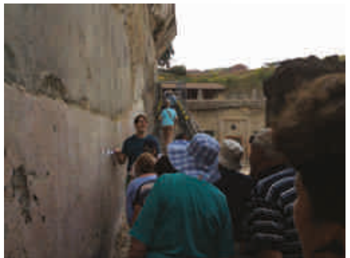
Shining a light on graffiti