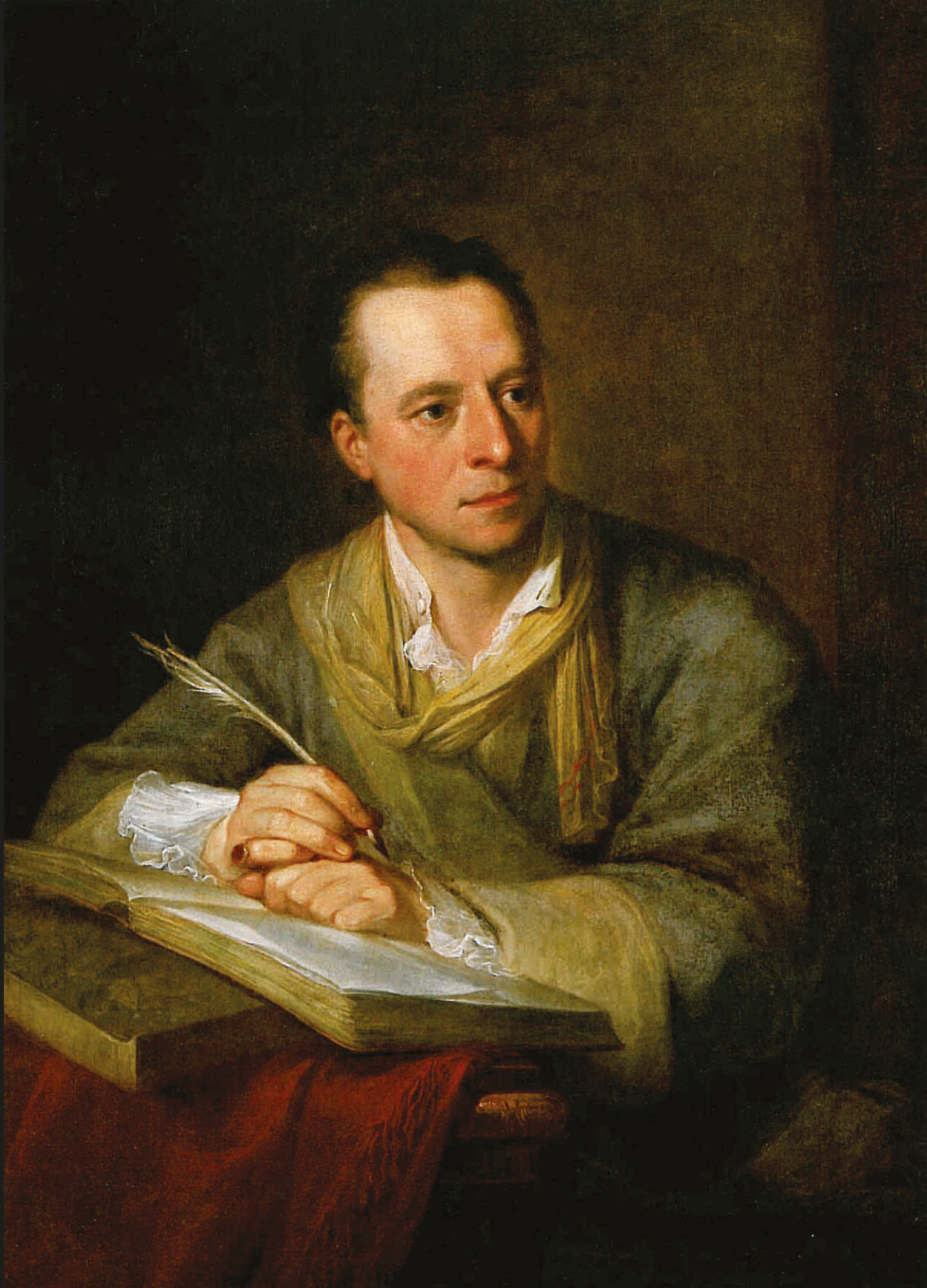
Johann Joachim Winckelmann by Angelika Kauffmann, 1764.

the newsletter of the Friends of Herculaneum Society - Issue 22 Autumn 2017