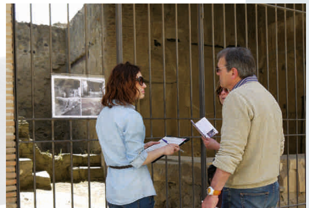
Visitors at the Bottega of the Plumbarius