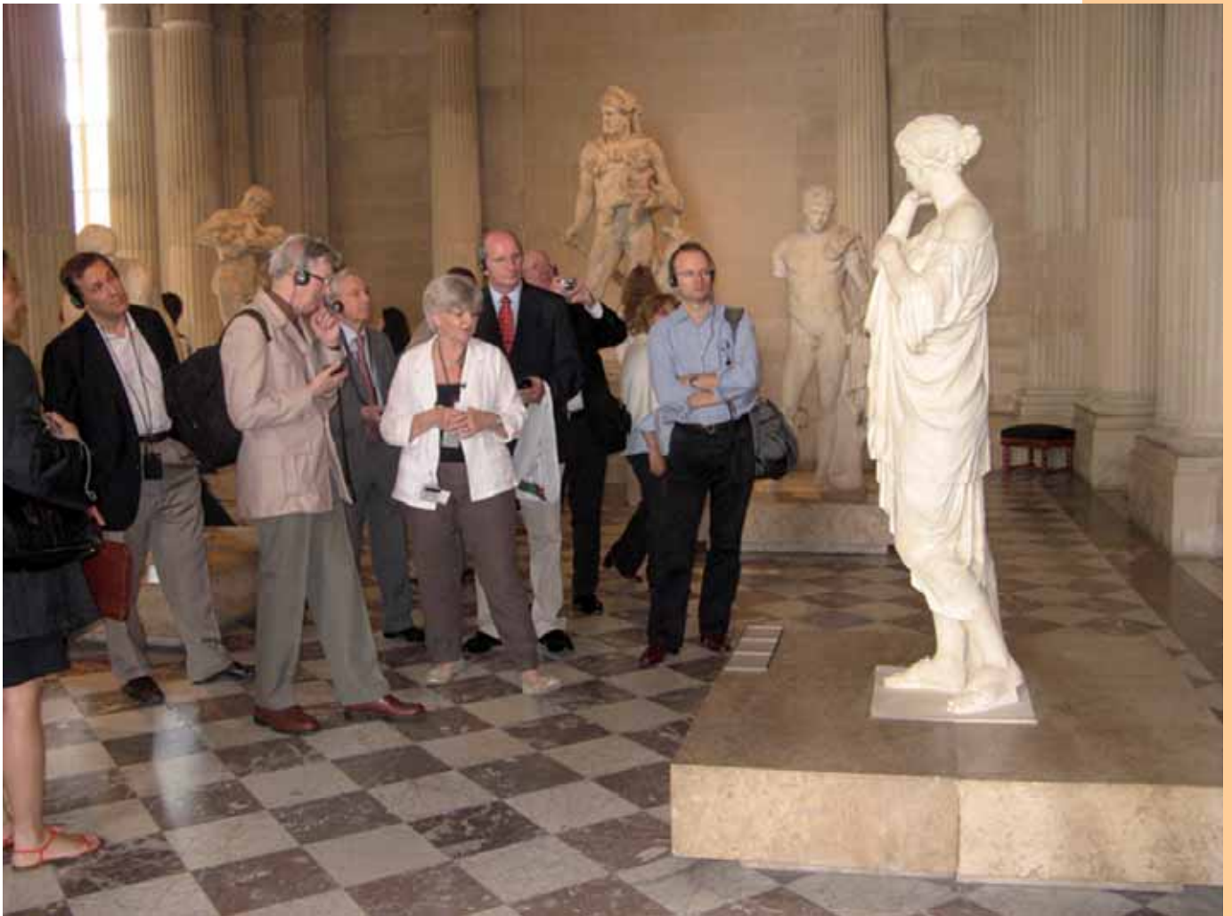
(Above) Members on a tour of the Greek and Roman antiquities at the Louvre