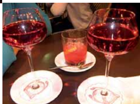
Refreshments at the end of the meeting