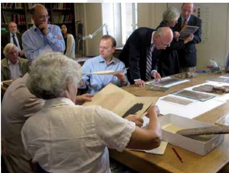
Members examining papyrus fragments, cartonnage, Egyptian texts and Greek texts from Egypt held at the Institute

The variety and excitement of these events is a clear testimony to the vitality of studies of the Herculaneum papyri in France and in other countries of Europe (participants came from Italy, Greece, Spain and Germany), as well as of the unique potential of the papyri to yield insights into antiquity that we could never derive from any other source.