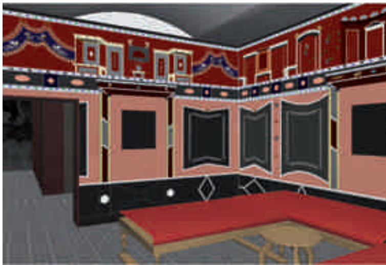
View of the Triclinium showing the reconstructed paintings and furniture.

In order to test the ability of the tools to computer model a Roman house it was necessary to construct a model of a house. Dr Shelley Hales of Bristol University kindly suggested that the building used for the test should be the House of the Wooden Partition in Herculaneum.