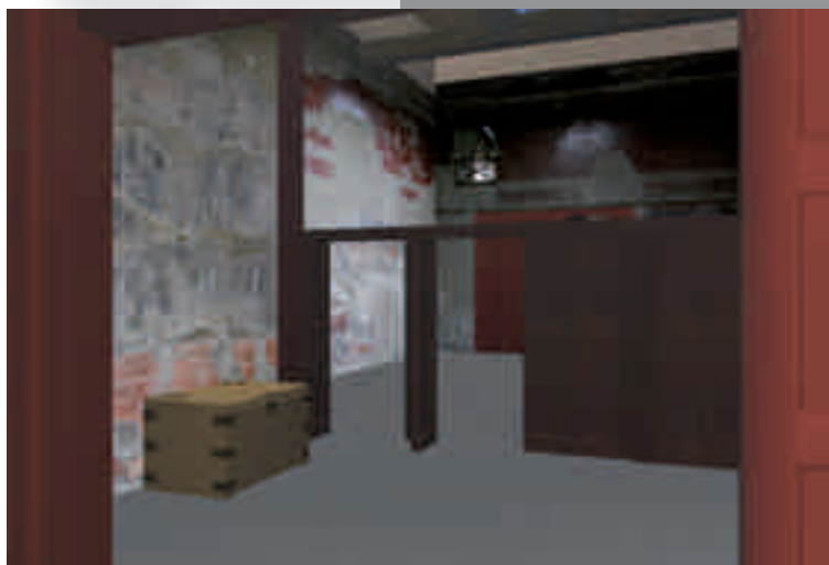
View of the Tablinum showing the walls in the their current state.

Consideration was also given to the needs of the viewer. One of the objectives of the Society is education, so the model should be internet compatible and viewable using software which is freely available. For the same reason the model should be easy to use. The decision was made to use, what is referred to as, a 'walk through model' in which the viewer need only worry about going forwards or backwards and turning left or right.