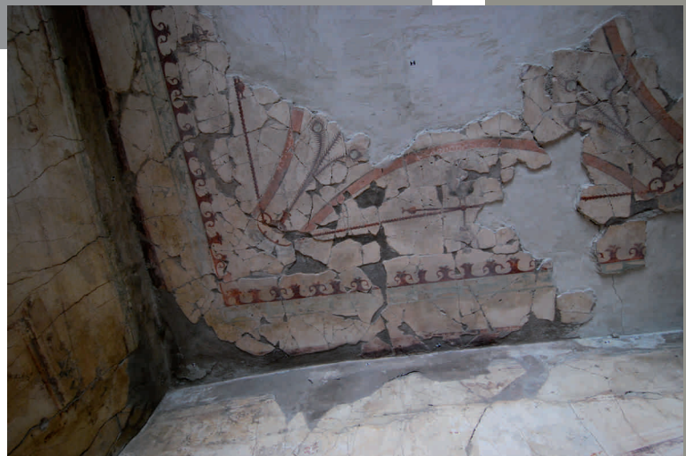
House of the Black Salon, (Casa del Salone Nero) Herculaneum

If one considers the proximity of this volcano and the imminent risk that one day it may explode in flames, create destruction on every side, and bury in fire and ash these delightful dwelling-places, centres of luxury and pleasure, it will be understood how easily men forget danger even when they see the threat in front of them. Portici is built over wealthy Herculaneum; Pompei is now being discovered after having remained hidden for long years under the ash that fell on it. In the king's gardens and various other places where deep excavations have been done there are as many as thirty distinct layers of lava, and six or seven of these are separated by fertile earth and mixed remains of buildings; in other words, this terrain, now inhabited by men in such security, has been flooded with torrents of fire over the centuries; six or seven times people have forgotten the last disaster, have cultivated and populated the area; equally often the horrors have been repeated, and yet men live above so many layers of destruction, without fearing that nature may in a single moment create such havoc once more.